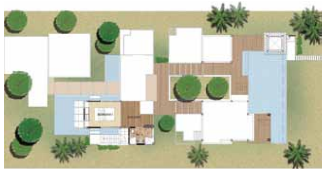
AIR 2ND FLOOR