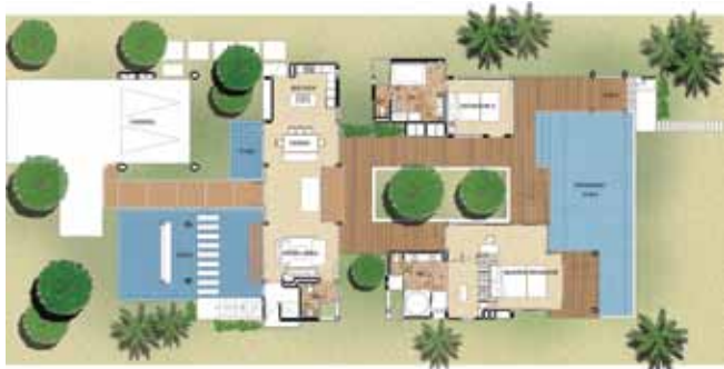
AIR 1ST FLOOR