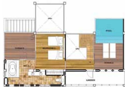
SKY LOFT UPPER