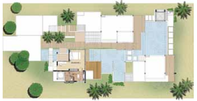
WIND 2ND FLOOR