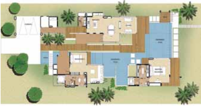
WIND 1ST FLOOR