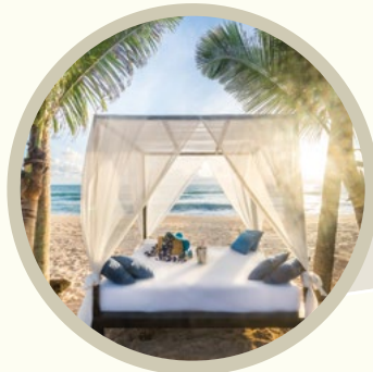
akyra BEACH CLUB PHUKET