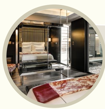
akyra MANOR CHIANG MAI

If your spirit of adventure is calling, pack your bags and start the discovery. We are ready to ensure that you enjoy unforgettable experiences in Thailand's most beautiful destinations.