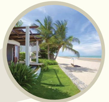
ALEENTA HUA HIN