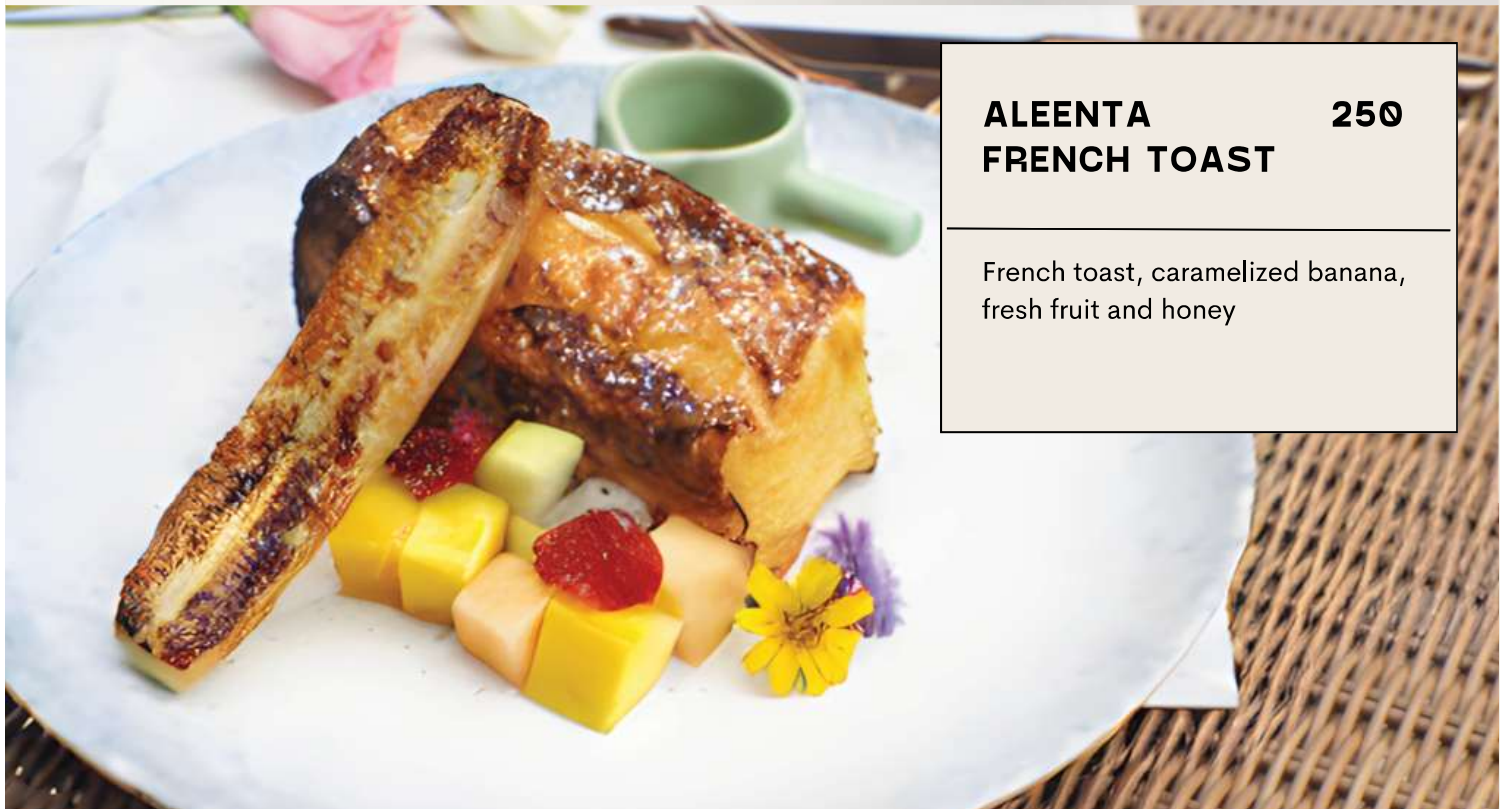
ALEENTA FRENCH TOAST 250

French toast, caramelized banana, fresh fruit and honey